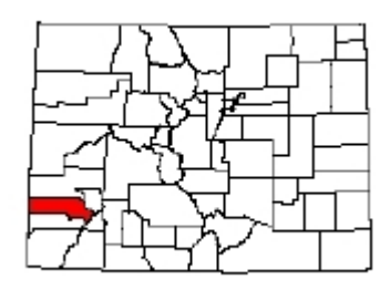
San Miguel County in Colorado

Mountain Village was developed to resemble a European alpine community (like Zermatt), just south of Telluride ski area's 1,700 acres. It was first developed as a Planned Unit Development in San Miguel County, adjacent to Telluride. It was incorporated as its own Town in 1995. The Mountain Village Core is a pedestrian-friendly area, which is linked to Telluride by the only free gondola system in North America serving over 2 million riders per year. The gondola serves as the main transportation vehicle between the communities (an easy 12-minute commute between them), and services all the ski slopes of both communities.